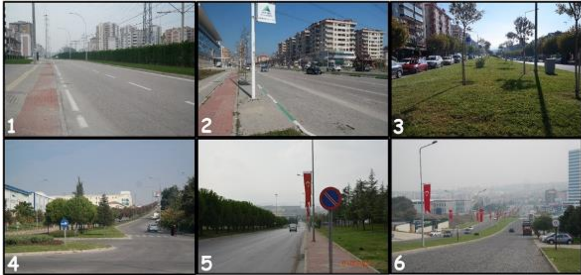
Figure 2. Bursa Nilüfer District Boulevards overview: (1) Uğur Mumcu Boulevard, (2) Ahmet Taner Kışlalı Boulevard, (3) Fatih Sultan Mehmet Boulevard, (4) Nilüfer Boulevard, (5) Atatürk Boulevard, and (6) 75. Yıl Boulevard.

Nilüfer Boulevard: The Nilüfer Boulevard located in the Nilüfer Industrial Zone intersects with Atatürk Boulevard. It is 1.10 km long.