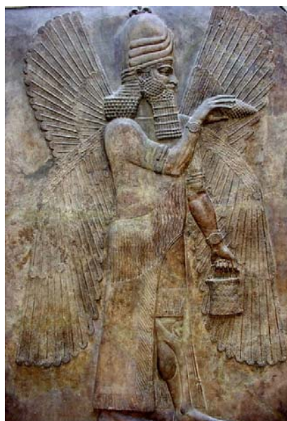
Fig. 4 Assyrian Winged Man