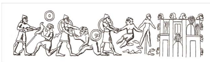
Fig. 5 Assyrians Dealt with the Vanquished in War. Balavat Bronze Gates