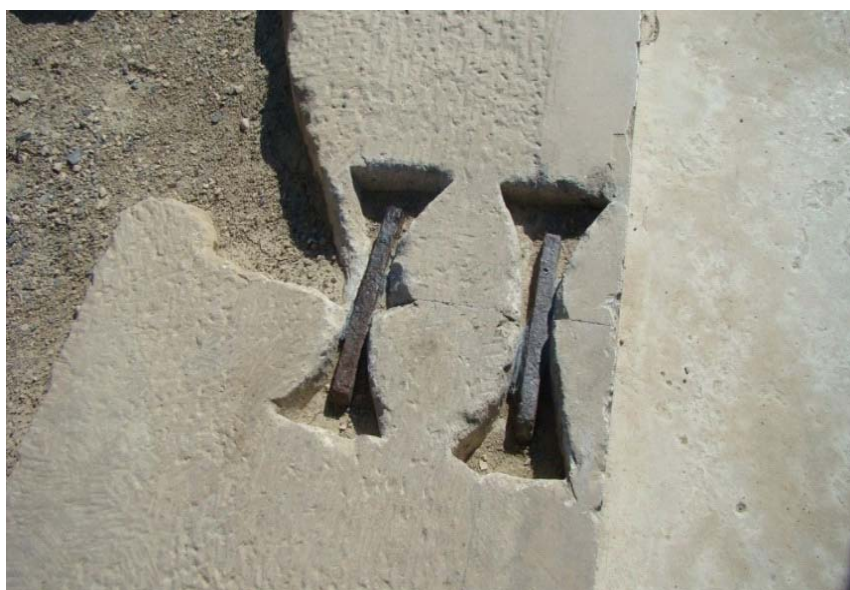
Fig.1 Swallowtail Staple. Place: Pasargadae